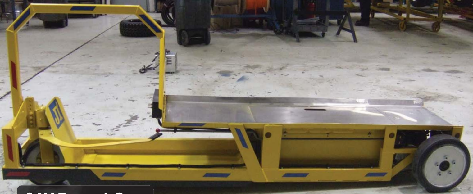
36V Tunnel Car